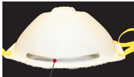
Adjustable aluminum nose bridge for a more secure fit