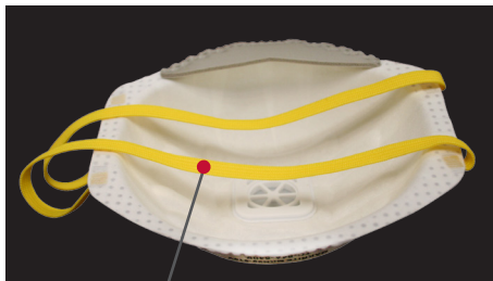
Double elastic comfort fit straps